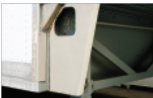
Wing Plate is heavy-duty and reinforced