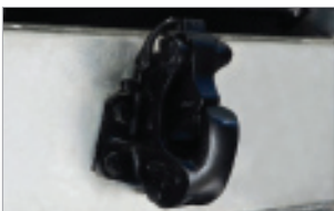
Pintle Hook is air operated and triples-rated for 28' trailer configurations