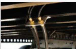
Wire Loom protects air and electrical lines